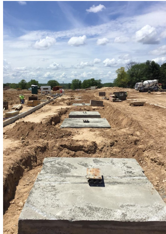
Column pads in Area B.