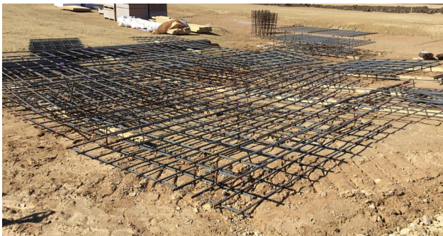
Rebar mats for column footings being prepared and ready to be set.