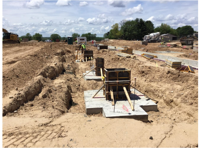
Column pads for East Entry in Area B being formed for pouring