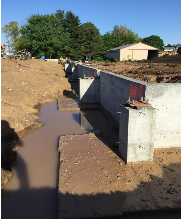
Area A Footing walls on north side poured and cured