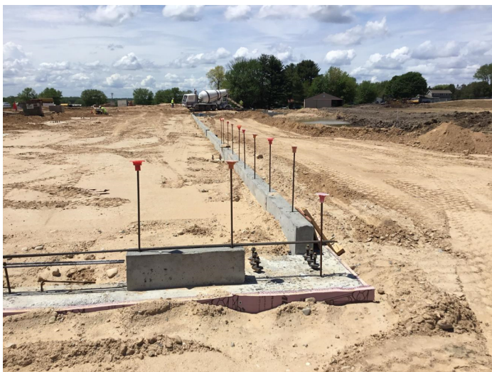
Area B walls have been completed and backfilled.