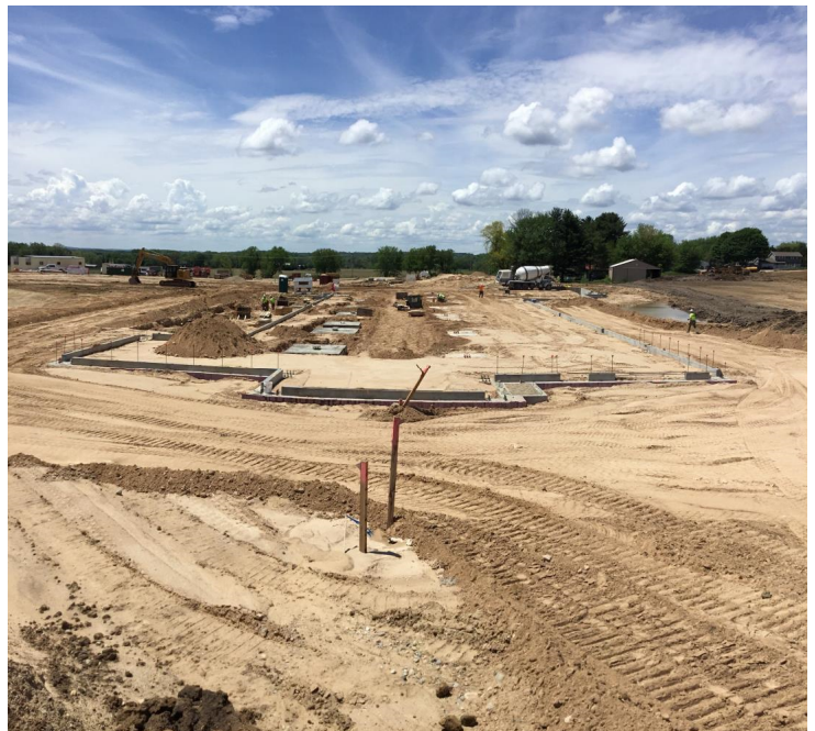
Area B, all footings and walls have been completed