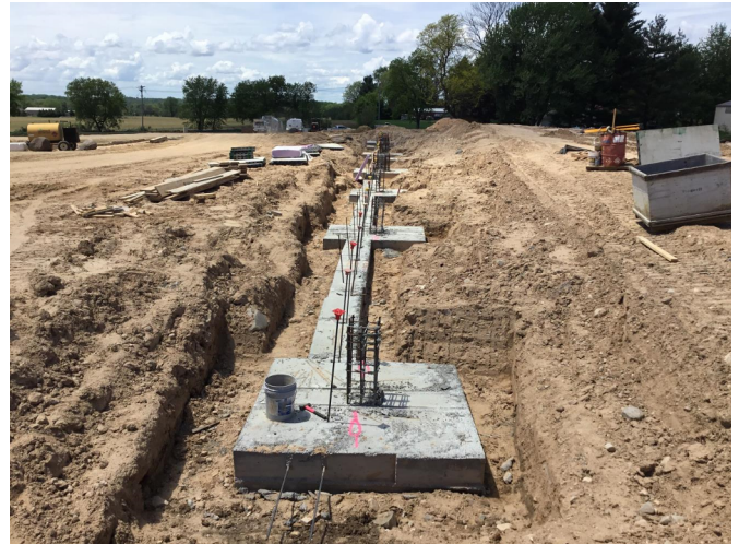
Area A footing, south walls to be formed and poured.