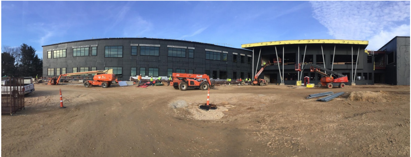
South side of Area A brick installation and front entryway AVB detailing.