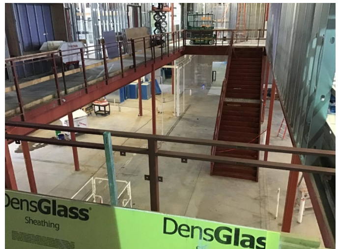
Area C feature stairs have been installed.