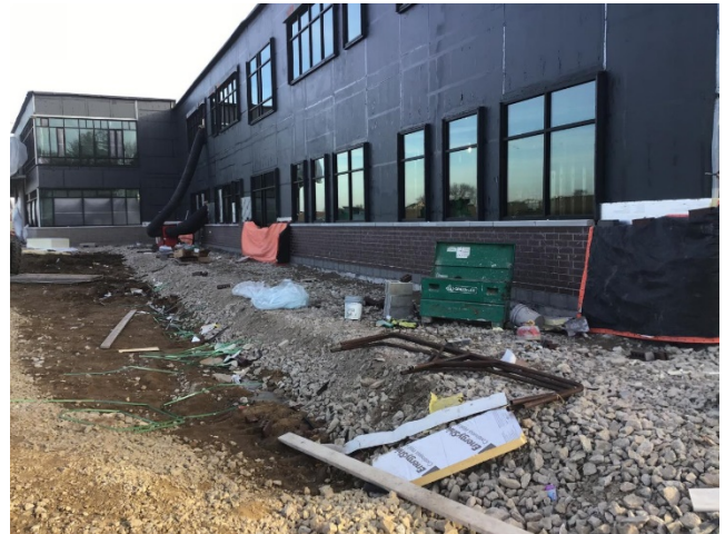
North side of Area A brick installation.