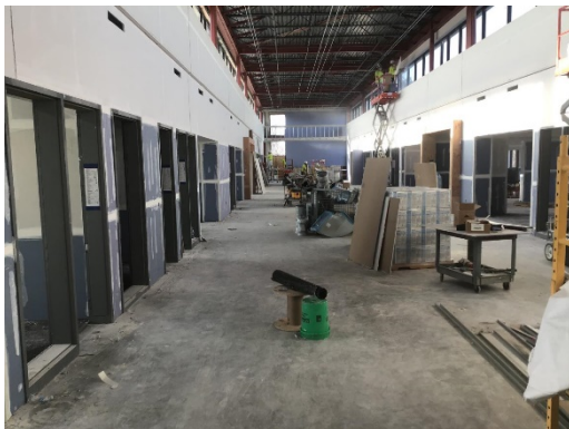
Level 2 Area A drywall installed and taping and finishing ongoing.