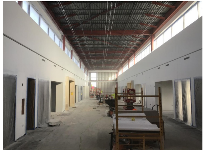
Level 2 Area B priming and painting.