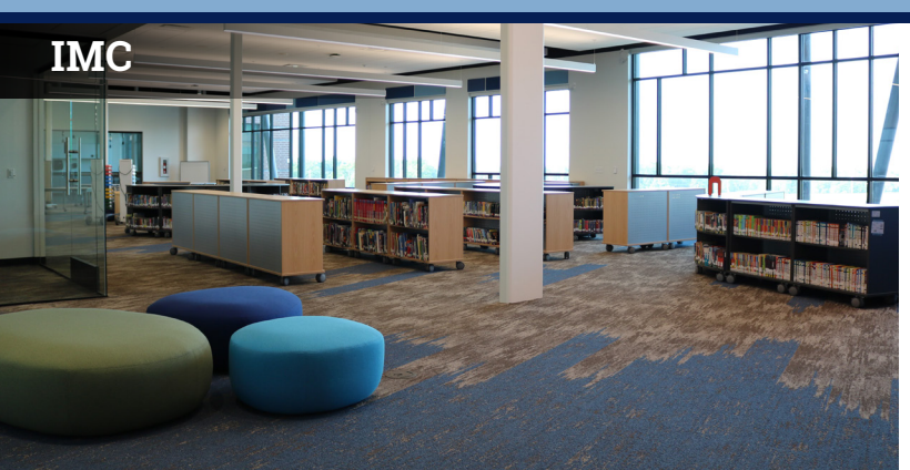
Modern school libraries are now called Instructional Media Centers (IMC). The IMC has two instructional spaces as well as two small group instruction spaces for students and staff to use. There is also a dedicated makerspace for hands-on learning.