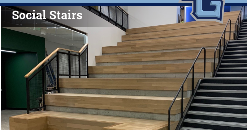
The social stairs are the heart of the school where students can meet with classmates or as a large group. The space allows the students to make independent choices and work creatively.