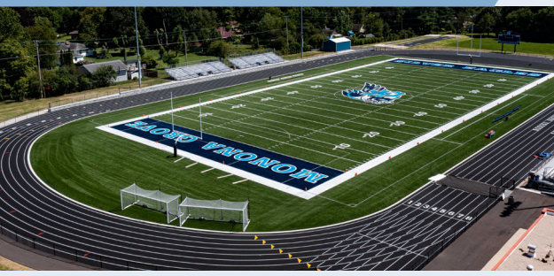
New turf field and track.