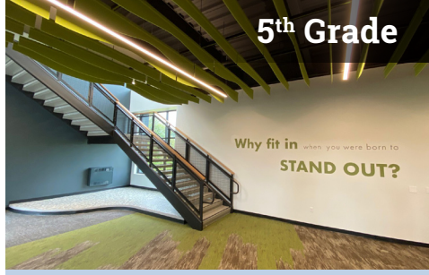
The 'Woodlands' is home to our 5th grade students. There are small group instruction rooms with whiteboards, and an area under the stairs called the learning cave.

More photos can be found on our website: www.mononagrove.org/report2021