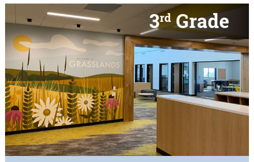
The 3rd grade students are in the 'Grasslands' habitat. The habitat themes are represented throughout the grade wings with color-specific furniture and finishes.