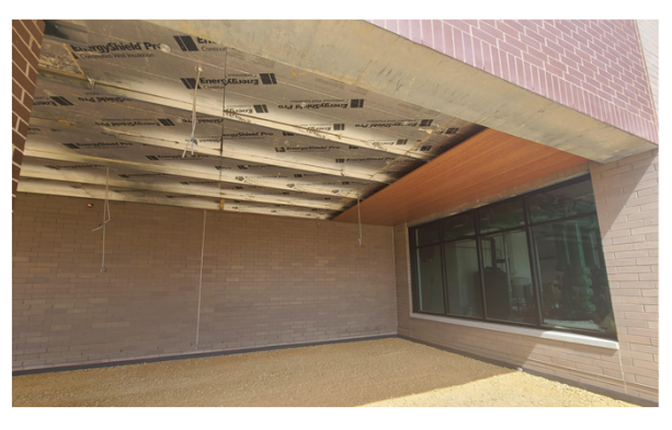
Area B Knotwood Soffit