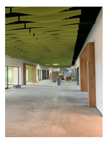
Level 1 Wood Trim