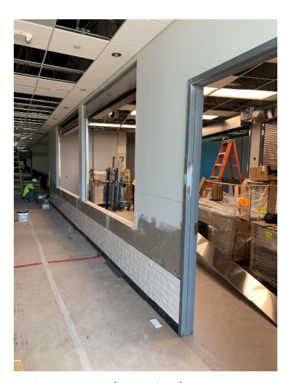
Servery Tile & Coiling Doors