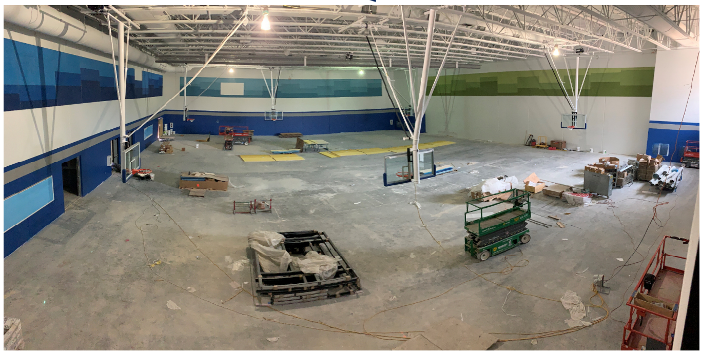
Acoustical Panels & Gym Equipment