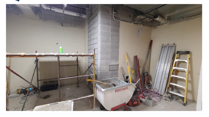
High School Concessions