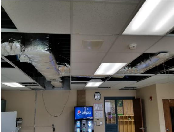
Staff Breakroom Ductwork