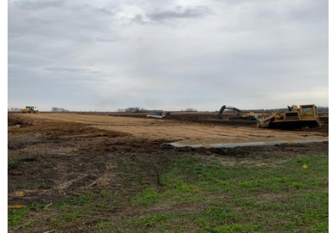
The first of two temporary roads are being installed into the job site on the Buss Road side of the street. This is where most deliveries and construction traffic will take place.