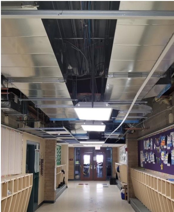
Corridor 205 Ductwork