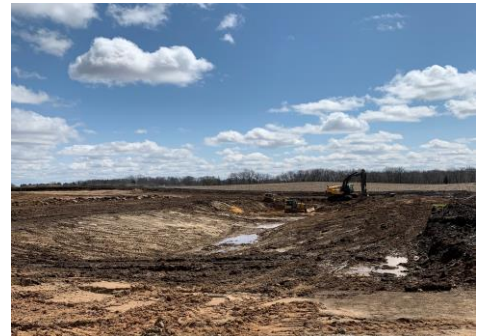
Grading for the west pond and infiltration basin has begun. Above is one of four infiltration basins that will be installed on site.